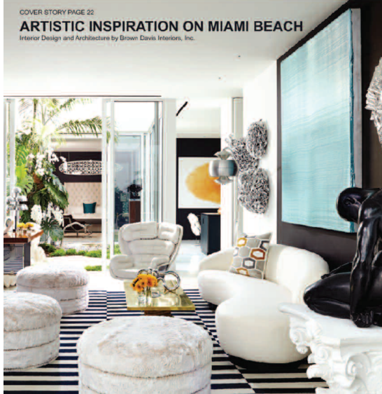
COVER STORY PAGE 22 ARTISTIC INSPIRATION ON MIAMI BEACH Interior Design and Architecture by Brown Davis Interiors, Inc.

IDEAS FOR BEAUTIFYING YOUR HOME WWW.FLORIDADDECOR.COM BROWARD/PALM BEACH EDITION | ISSUE 3 VOL. 11 2019